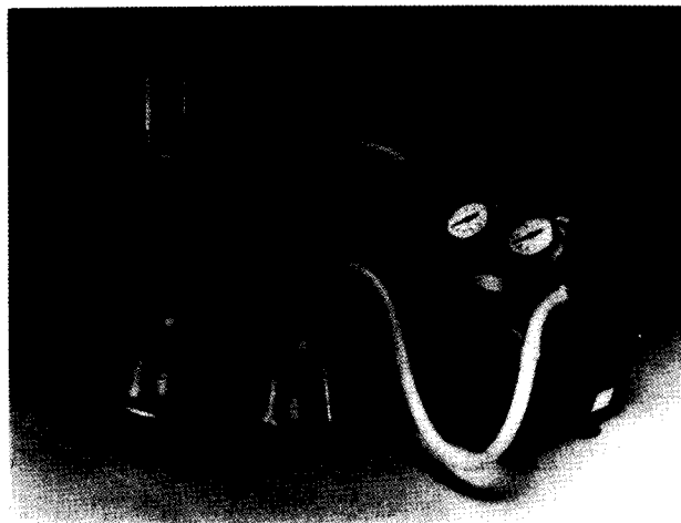
Fig. 2. Second side arm flask connected in series keeps liquid droplets or water vapor out of pump.