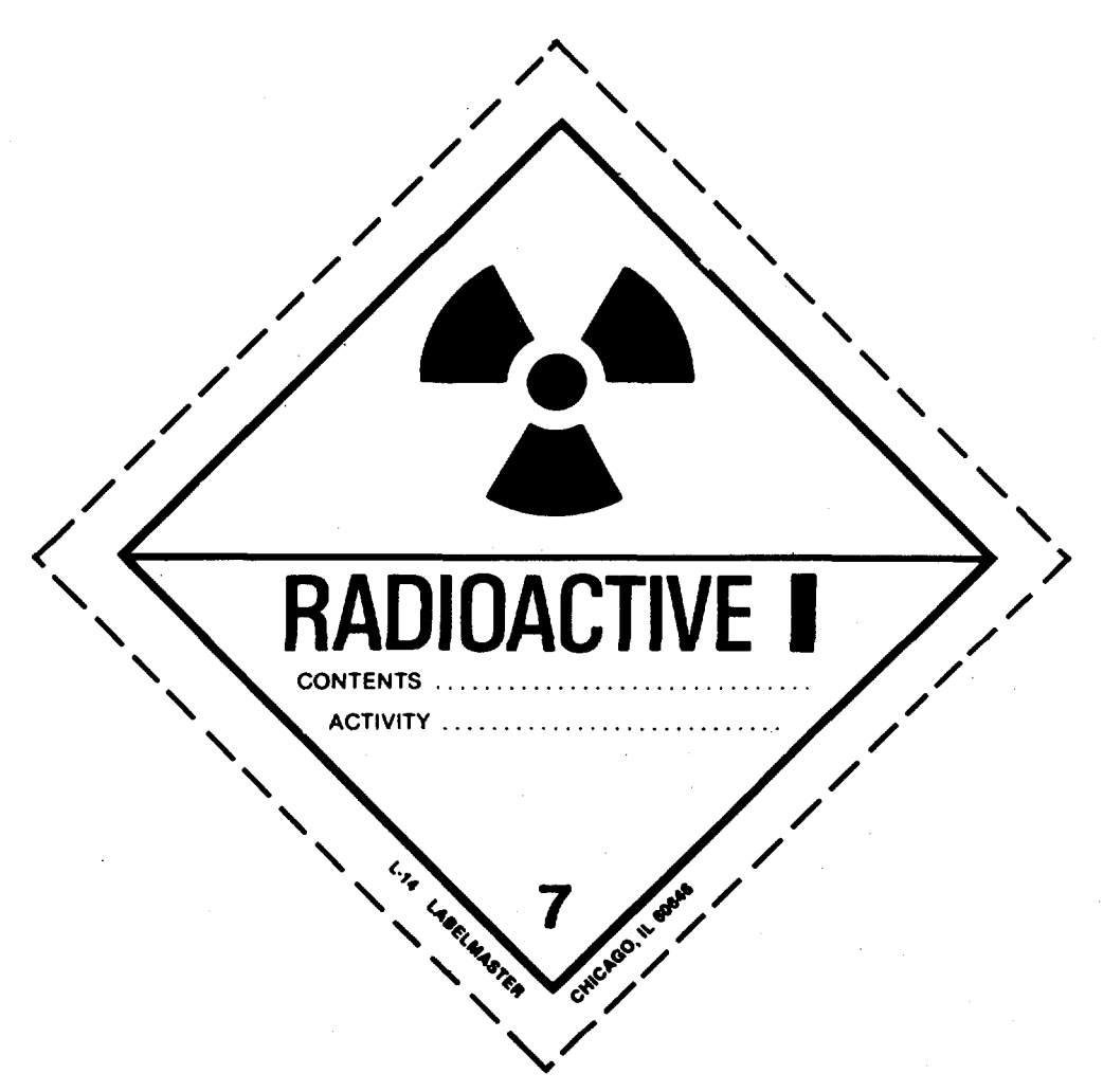
Figure 5-1. Radioactive White-I label (SF 413).

LABEL MUST BE DIAMOND SHAPED WITH AT LEAST 4 INCHES (101 MM) ON EACH SIDE AND WITH A BLACK SOLID LINE BORDER ON EACH SIDE 1/4 INCH (6.3 MM) FROM THE EDGE. THE LABEL MUST BE WHITE; THE PRINTING AND SYMBOL MUST BE BLACK EXCEPT FOR THE "I," WHICH MUST BE RED. ALSO, IT MUST COMPLY WITH THE LABEL SPECIFICATIONS OF 49 CFR 172.407.