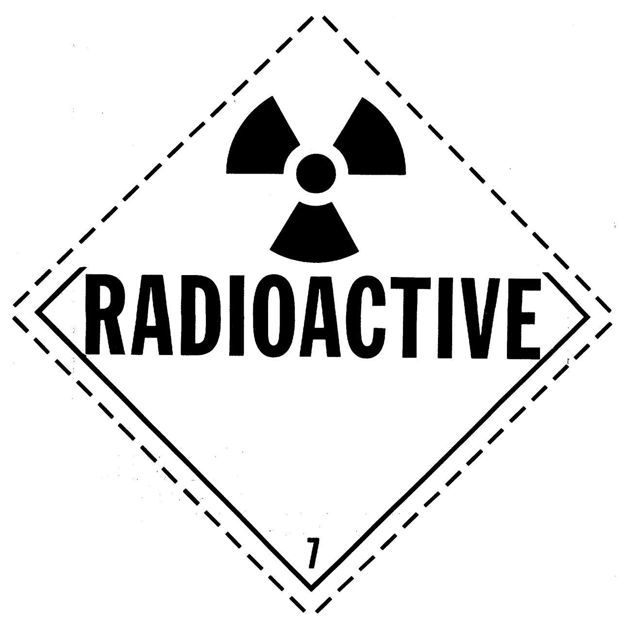
Figure 5-8. Radioactive placard (49 CFR 172.556).

THE TOP PORTION OF THE "RADIOACTIVE" PLACARD MUST BE Yellow and the symbol black. The lower portion must be white and the inscription black.