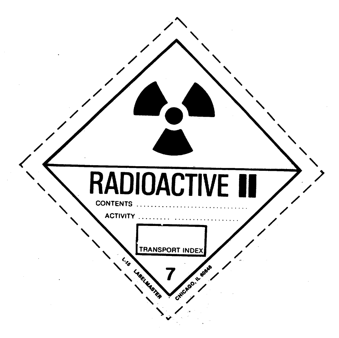
Figure 5-2. Radioactive Yellow-II label (SF 414).

LABEL MUST BE DIAMOND SHAPED WITH AT LEAST 4 INCHES (101 MM) ON EACH SIDE AND WITH A BLACK SOLID-LINE BORDER ON EACH SIDE 1/4 INCH (6.3 MM) FROM THE EDGE. THE LABEL MUST BE YELLOW IN THE TOP HALF AND WHITE IN THE LOWER HALF. THE PRINTING AND SYMBOL MUST BE BLACK EXCEPT FOR THE "II," WHICH MUST BE RED. ALSO, IT MUST COMPLY WITH THE LABEL SPECIFICA-TIONS OF 49 CFR 172.407.