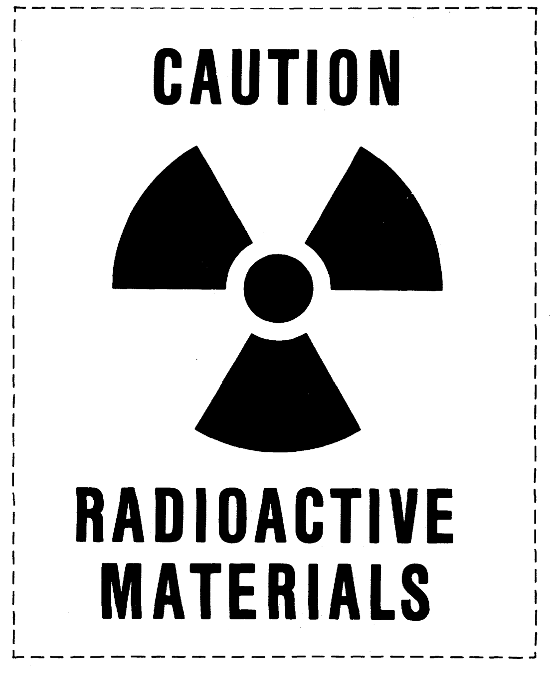
Figure 5-6. Radioactive materials warning sign.