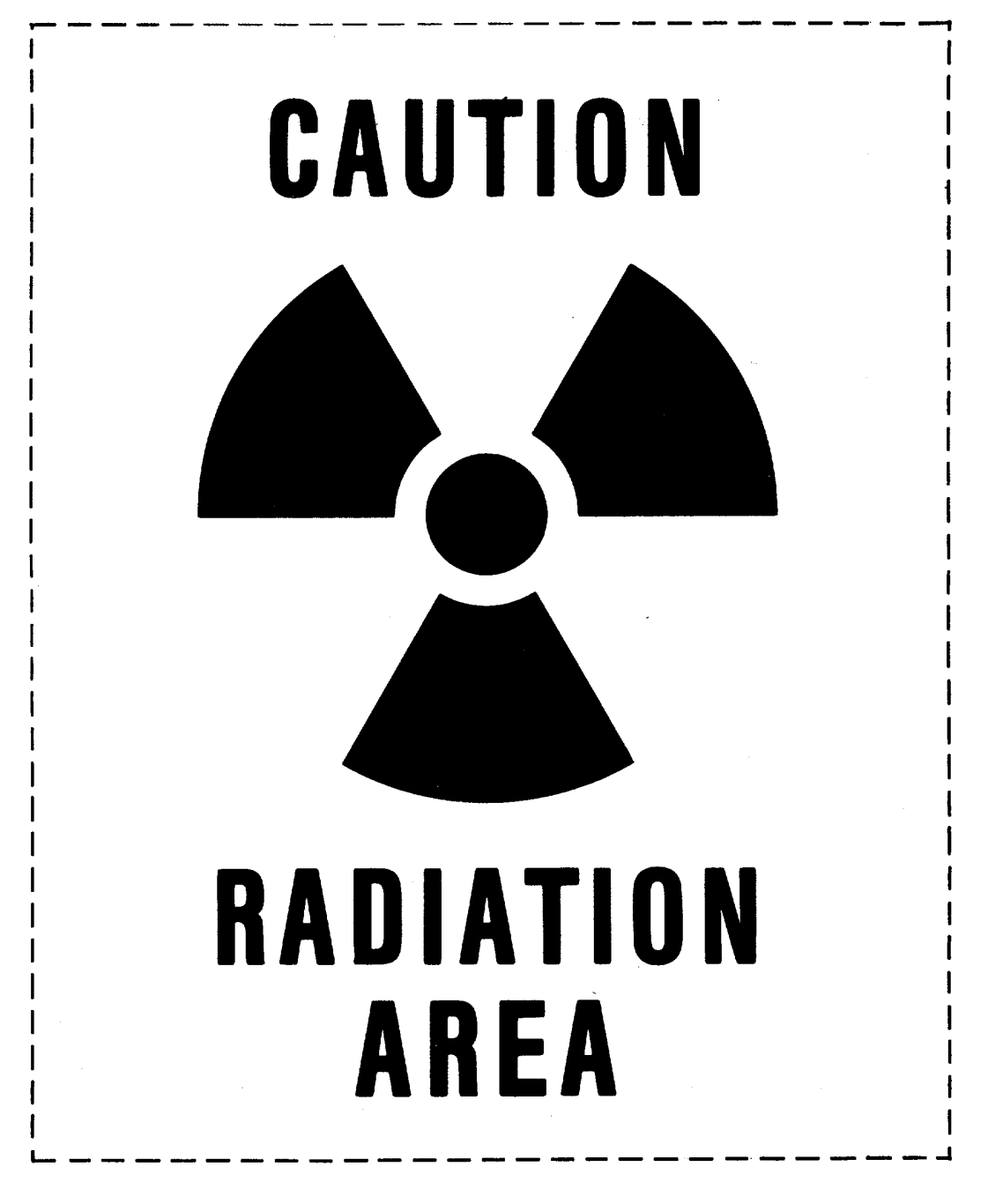
Figure 5-5. Radiation area warning sign.